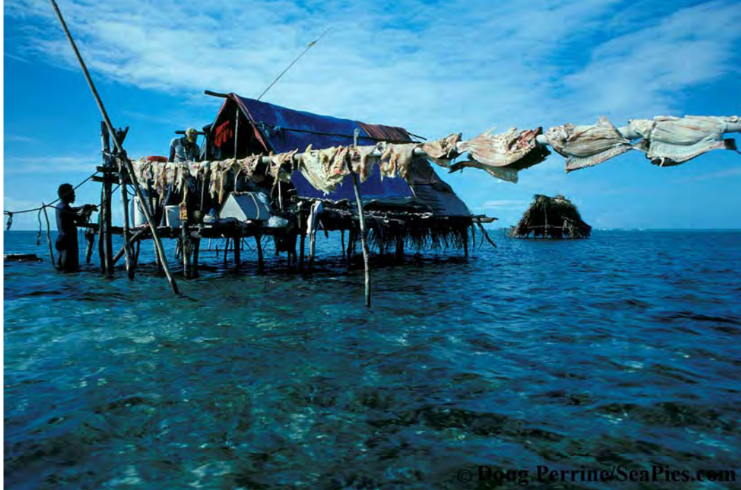
Figure 5: Fish-drying racks (tendedores) at Caye Glory.

The fishermen also salted the roe, although by a slightly different and easier process from that used for the rest of fish. The roe was sold or often used as “rent” for the fences, piers and roofs used to dry grouper. 27