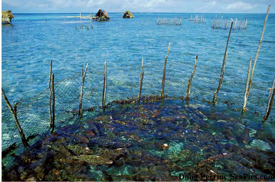
Figure 4: Fish corrals or holding pens built from mangrove stakes and chicken wire used for keeping the Nassau grouper alive.

Fishing at Caye Glory during the Nassau grouper spawning aggregation was hard work (Craig 1966, Carter 1988). The fishing was done in deep water on the outside of the reef. Fish were placed in the dories and “we had a guy there beating them with a stick.” 24 Inside the reef, the fishermen built shacks or camps in which they ate, slept and corned, or salted and dried, their fish. The more prosperous fishermen also had pens, essentially wire cages in 3 or 4 feet of water, in which they kept fish alive and took them to market live. Those with no pens had to corn their fish at the end of each day in order to preserve them, while the others corned only the fish that did not survive to get into the pens. Descriptions of that hard work from the interviewed fishermen again reinforce the picture of bounty, as illustrated by the following comments: