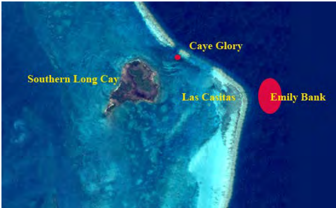
Figure 2: Satellite image of the Caye Glory reef promontory showing location of the former island of Caye Glory, the grouper spawning site and shoal where local fishermen establish themselves temporary camps.