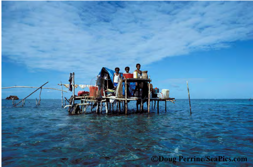
Figure 3: A hut at Caye Glory build on the shoals during the grouper spawning season.

Although the numbers that once typified the aggregation can never be known, the early literature provides an unambiguous albeit unquantified picture. In 1944 the spawning aggregation at Caye Glory was described as follows: