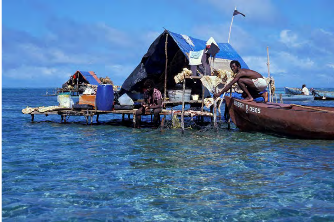
Figure 6: Dugout canoes or dories used to handline for grouper off the Caye Glory spawning site.

longer due to an additional 3-5 days of processing, primarily through drying in the sun (Thompson 1944, Craig 1968, Gordon 1981).